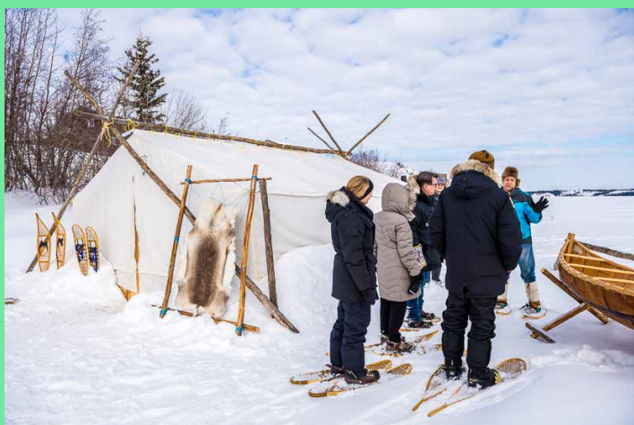
Visit a First Nation community and learn about the Dene people and their way of life.