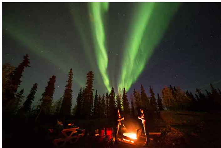
Enjoy the ethereal beauty of the Northern Lights over the Canadian boreal forest!

Auroras are visible from Yellowknife almost every night as long as the skies are clear . In case of cloudy nights, we have designed our tours to be six nights long to maximize the probability of seeing the Northern Lights. We have also planned daytime activities to take advantage of the wonderful things Yellowknife has to offer.