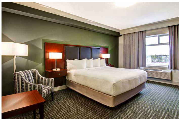
Choose between one-king and two-queen bedrooms among other choices.