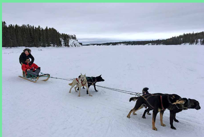
Drive your own dog team on a frozen lake and enjoy winter nature at its best.